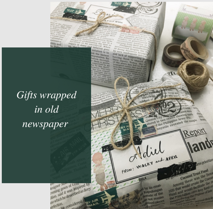
Gifts wrapped in old newspaper