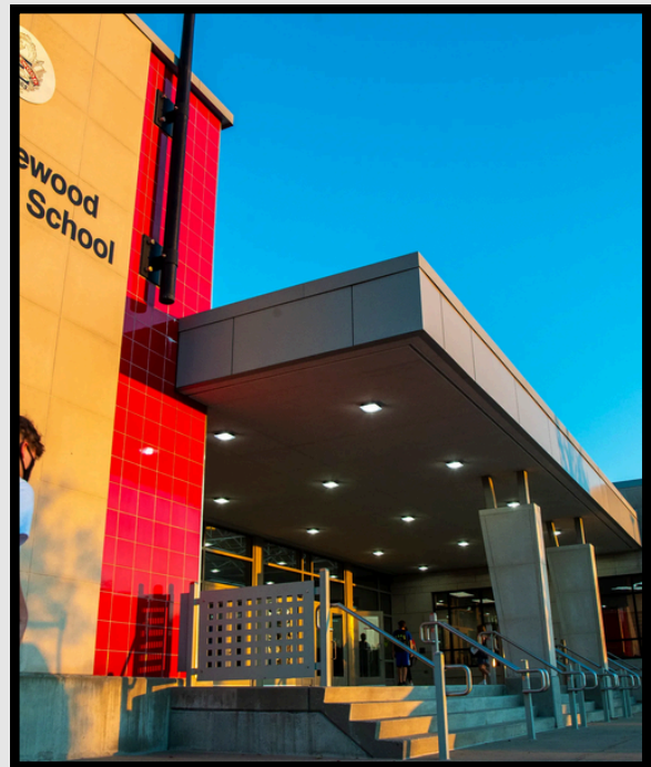
Edgewood High School

As the semester comes to a close with the club's final publication for 2024, I am extremely satisfied with the work we have accomplished during this first semester. This week, we successfully implemented battery recycling sites at each school on the RBBCSC campus! These sites are another way the Environmental Club promotes sustainable practices, not just in the high school but throughout the entire campus. Additionally, we are in the